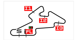
Automotodrom Brno 5403 m.