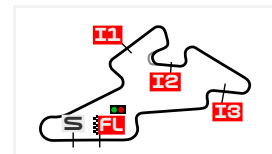
Automotodrom Brno 5403 m.