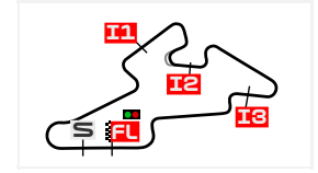
Automotodrom Brno 5403 m.